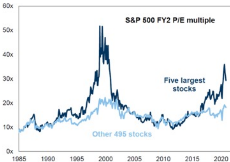
Chart courtesy of Goldman Sachs

FAAMG basket trades at 29x 2021E EPS compared with 18x for rest of S&P500