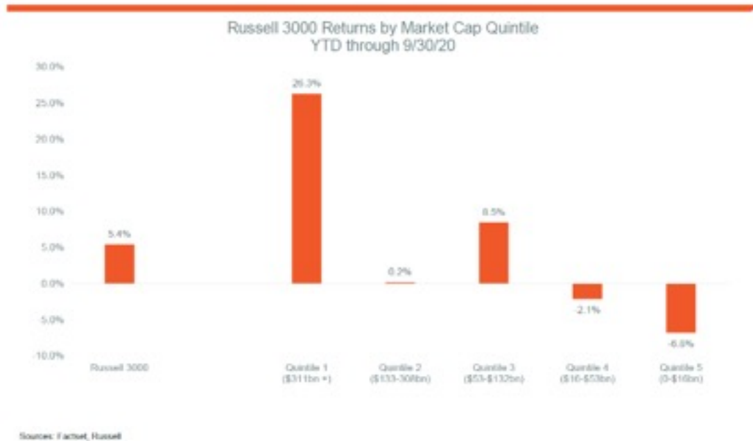
Chart courtesy of Atlanta Capital Management